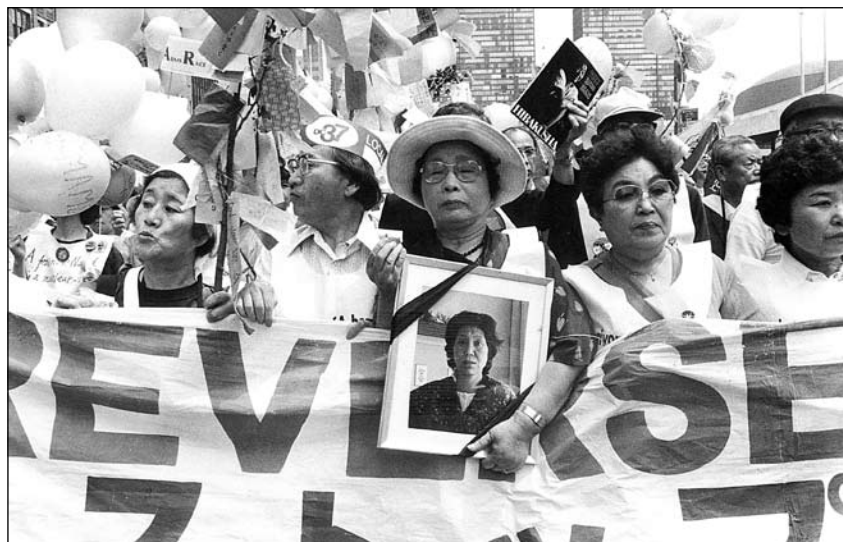
Delegation of hibakusha, atomic bombing survivors, at the Nuclear Freeze rally of 800,00 people in New York City, June 12, 1982.

We hosted the hibakusha in April of 2002, shortly after my brother’s remains from the World Trade Center had been positively identified by DNA testing. That morning I visited the NY Medical Examiner’s office where I learned about the size of the bone fragment that had been recovered, and the blunt force trauma that had created it. I stood under a white tent outside the office, where there were a number of refrigerated trailers, and paid my respects to the trailer that held his remains. Then I walked to the World Trade Center site and joined the hibakusha , who almost 60 years earlier had been targeted so violently by our government