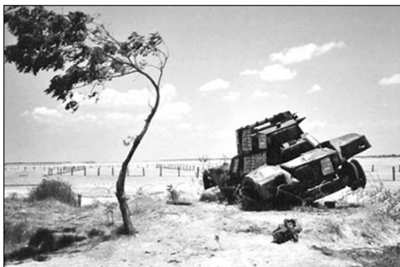
Impact of war on Sri Lanka.

Each year since September 11, 2001, NP has encouraged people to work that day annually for peace and donate their wages (or some other amount) for our conflict intervention work. This year the centennial celebration of satyagraha is very empowering for us. “Peaceforce” is our translation of Gandhi’s satyagraha , and we hope our work manifests his vision. We are asking everyone to sign a statement resolving to break the cycle of violence: “I choose to break the cycle of violence. I will seek to resolve my own conflicts without violence; and I will encourage nonviolent responses to conflict by my neighbors, governments, and civilians worldwide.” For a kit designed to help you hold a September 11th “break the cycle” gathering, please see www.nvpf.org/np/english/workadayforpeace/toolkit.asp.html . ☪