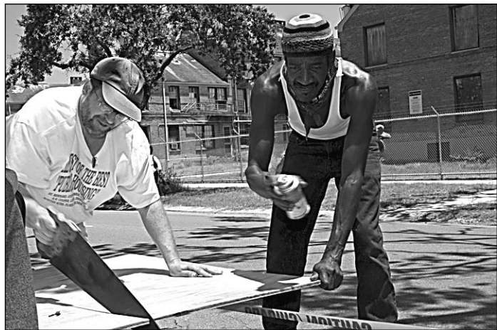
A volunteer and a resident construct a shelter for a tent city, Survivors Village, outside a New Orleans public housing complex slated for demolition. HUD plans to demolish over 2/3 of its pre-Katrina units. The United Front for Affordable Housing protests. Photo: June, 2006 © Diane Greene Lent.

We need your solidarity. Let us struggle together. ☪