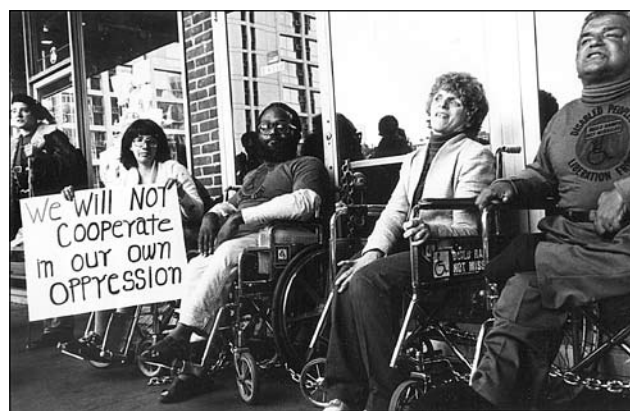
The Disabled Peoples Liberation Front blockades an inaccessible Boston movie theater, 1987.