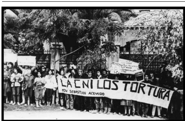
Chileans defy the dictatorship and denounce torture.

The WRI is united in its opposition to all war and militarism, from the production and trading of small arms to the waging of large scale wars and “ethnic cleansing.” For WRI’s African associates, globalizing nonviolence is not just a goal — it’s a necessity. ☪