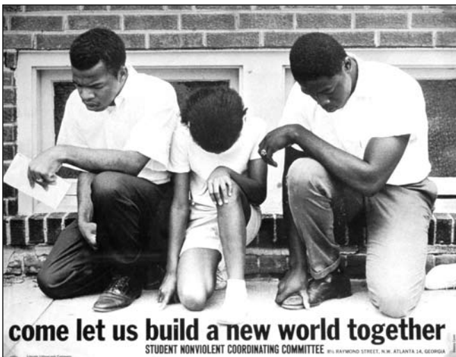
Poster: Center for the Study of Political Graphics

People's passion to be free and independent should not ever be in doubt. Nor should our willingness to help each other. It is not for any nation to win another its rights. Those rights will be won by people who stand up to domination and learn to liberate themselves. It is only for us to stand with them. ☪