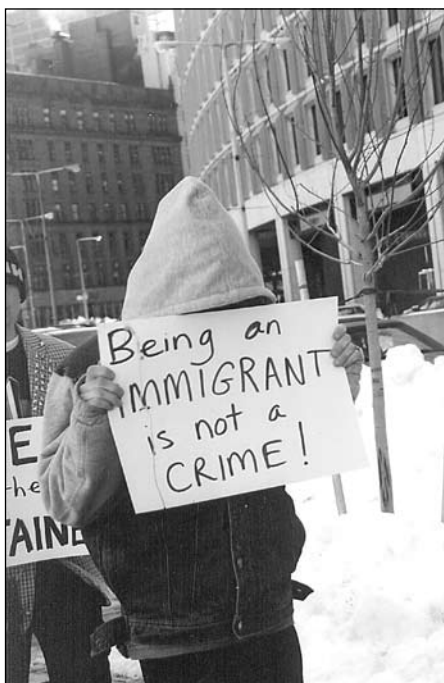
Protesting INS detention policies, Boston, January 9, 2003, © Ellen Shub

I wish respectfully to suggest it to you that, if you have not the will or the ability to stand firm even when you are perfectly isolated, you must not only not take the pledge yourselves, but you must declare your opposition before the resolution is put to the meeting and before its members begin to take pledges and you must not make yourselves parties to the resolution. Although we are going to take the pledge in a body, no one should imagine that default on the part of one or many can absolve the rest from their obligation. Every one should fully realize his responsibility, then only pledge himself (sic) independently of others and understand that he himself must be true to his pledge even unto death, no matter what others do. ☪